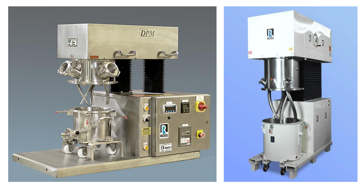
Vacuum-rated Double Planetary Mixers are offered from 1-quart to 750-gallon capacities. Mixer features are easily customized to accommodate any drying application. Options include rotating and sidewall thermocouples, sanitary gearbox, sidewall and bottom scrapers, custom sight/charge ports and CIP spray nozzles.